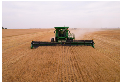
Montana Camelina harvesting