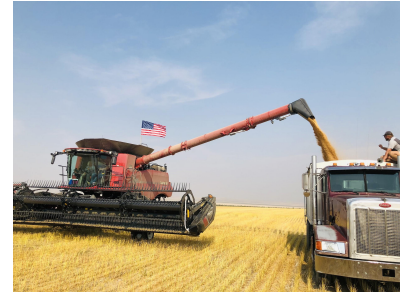
Montana grain transfer to truck

TORRANCE, CA July 29, 2021 — Global Clean Energy Holdings, Inc. (OTCQX: GCEH), a fully integrated renewable fuels company, provides a mid-year corporate update of the first half of 2021. Additional financial information will be provided in the June 30, 2021 Quarterly Report on Form 10-Q.